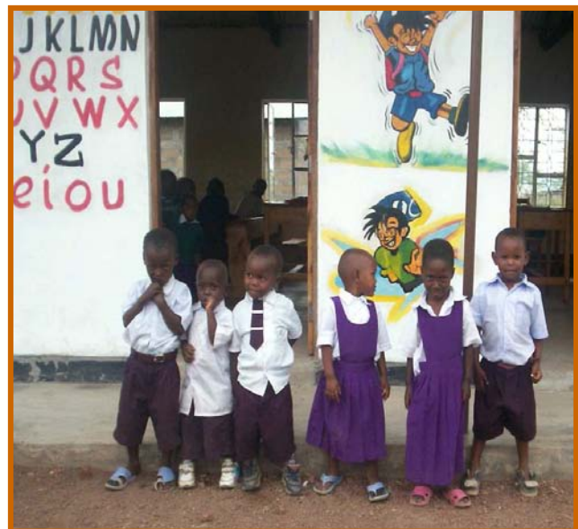
Uniformed students at the Migungani Nursery School, which opened in January, 2007.