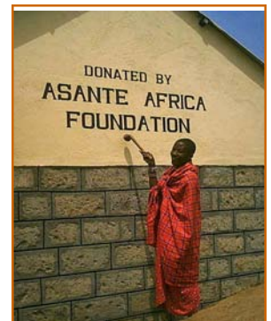
Celebrating the completed Dormitory

We recognize that schools need help meeting the fundamental environmental needs of students in order to make educational opportunities possible. Delivering education is not just about tuition, classrooms and teacher supplies—the first steps to a successful education often come in the shape of plumbing pipes, cement blocks, and rain-proof roofing. We are committed to understanding the true need from our local contacts and helping where we can be most effective in our mission.