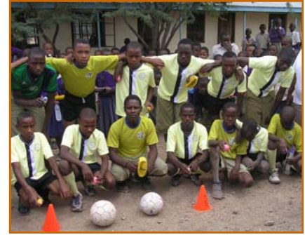
A school soccer team in uniforms collected by the Foster City Rotary Club