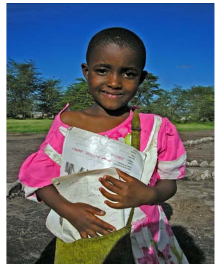
A student proudly carries her English homework, supported by your donations.

Spread the word and generate donations... Host a group presentation or party, forward this newsletter, expand the circle of awareness about our work.